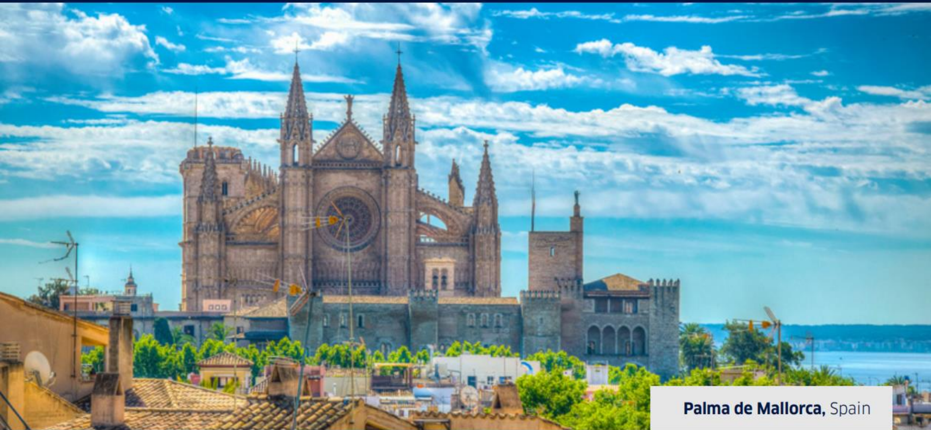
Palma de Mallorca, Spain