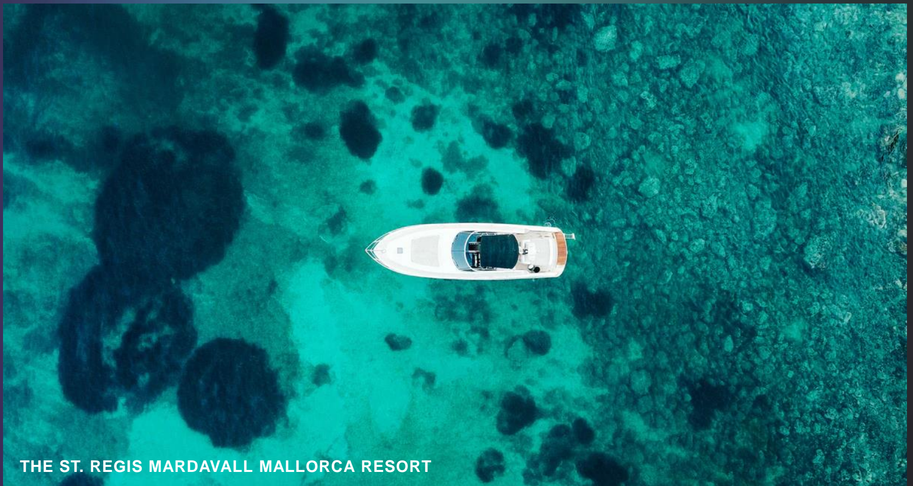
THE ST. REGIS MARDAVALL MALLORCA RESORT

Our unrivaled collection of exceptional properties brings a new diversity to luxury travel with a uniquely broad scope of experiences and styles. And, when you book with a travel advisor that is a part of Marriott International's STARS & LUMINOUS program, you have exclusive access and benefits at these premium and luxury hotels.