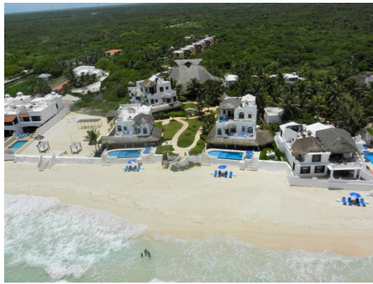
Hacienda del Secreto