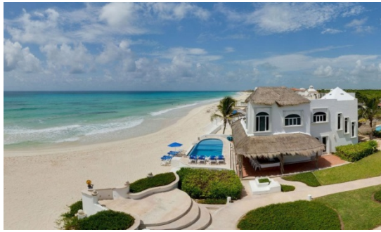
Villa Canteena

Events w/ more than 90 Pax may require event tent(s) added to Palapa beach side entrance to extend area. Tents not included. Event Location/Site Fees do not include banquet/party equipment such as tables/chairs/linens, lounge furniture, cocktail tables or additional decorations.