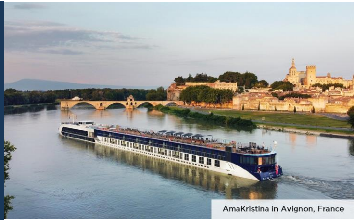
AmaKristina in Avignon, France

7-night cruise from Lyon to Arles September 24-October 1, 2026 | AmaKristina