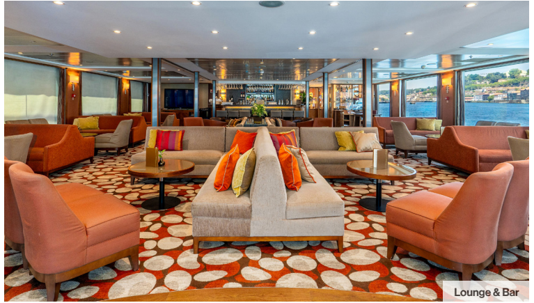
Lounge & Bar