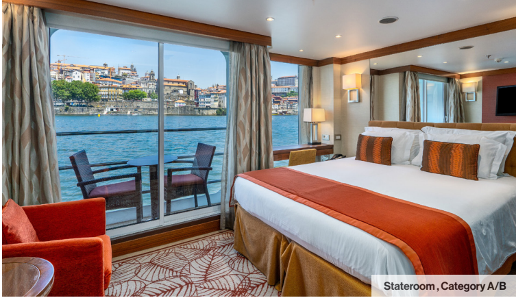
Stateroom, Category A/B

August 28-September 4, 2027 | 7-night cruise | aboard AmaVida