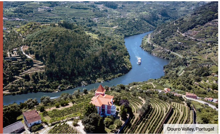
Douro Valley, Portugal

August 28-September 4, 2027 | AmaVida 7-night cruise from Vega de Terrón to Porto